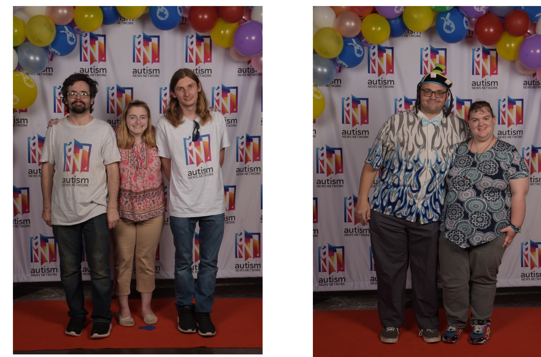
Figure 3. Public speaking ability before and after joining The Autism News Network